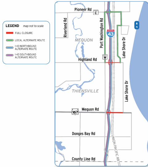
Above: Full closure of Highland Road

starting this past Wednesday, June 19, for crews to perform concrete work for five days. Both I-43 northbound and southbound ramps at Highland Road are closed as well. Access is being maintained for emergency responders. Motorists are encouraged to use Port Washington Road (County W), Pioneer Road (County C), and Lakeshore Drive to get around this closure. Barring any weather delays, Highland Road is anticipated to reopen Monday morning, June 24.